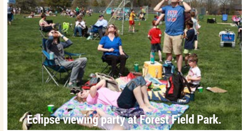
Eclipse viewing party at Forest Field Park.