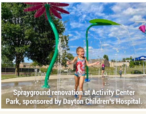
Sprayground renovation at Activity Center Park, sponsored by Dayton Children's Hospital.