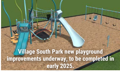
Village South Park new playground improvements underway, to be completed in early 2025.