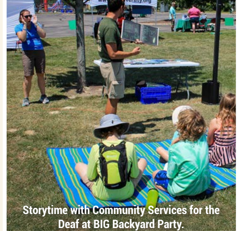
Storytime with Community Services for the Deaf at BIG Backyard Party.