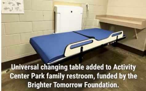
Universal changing table added to Activity Center Park family restroom, funded by the Brighter Tomorrow Foundation.

The Park District remains committed to our vision of becoming the community's outdoor recreation destination of choice. In 2024, we welcomed 10,257 program registrations across 600+ programs and events . Our 36 special events drew approximately 16,000 attendees , while staff and volunteers brought environmental education to over 3,000 students . Additionally, 4,900 youth athletes utilized our athletic facilities, bringing total participation across all programs to nearly 35,000 . The Park District also hosted 250,000 visitors for youth sporting events!