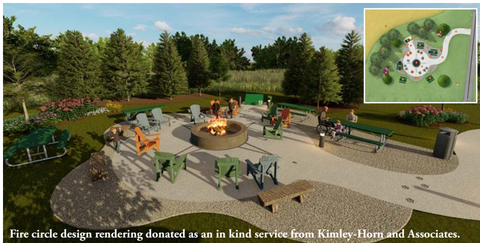
Fire circle design rendering donated as an in kind service from Kimley-Horn and Associates.

This project will create an accessible fire circle, ensuring individuals of all abilities can enjoy this special park amenity. By adding an ADA-compliant pathway, accessible surface and supportive seating, we will foster recreational inclusivity for the community.