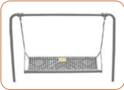
Gray with Gold Plaque