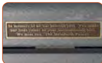
Bronze with gold lettering and border.