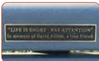
Black with silver lettering and border.