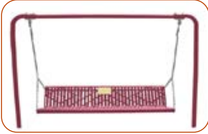
Burgundy with Gold Plaque