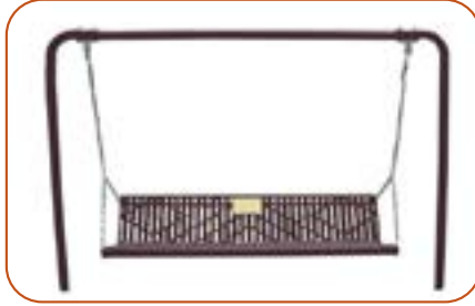
Brown with Gold Plaque