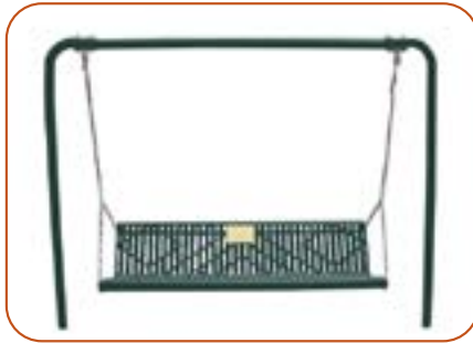
Evergreen with Gold Plaque

All requests for bench memorials go through an approval process. The Centerville-Washington Park District retains the right to approve or deny plaque wording. The Park District reserves the right to deny memorial requests, as well as remove existing memorials in the event the Board of Park Commissioners determine that the bench naming would adversely impact the reputation, image, mission, or integrity of the Centerville-Washington Park District.